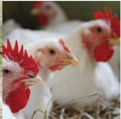
Worf & the broiler babies