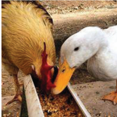
Bubble & Squeak